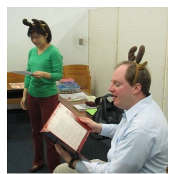
PAS Naha staff reading "The Night Before Christmas" to an audience

Dec 20 - Naha's Public Affairs Section (PAS) celebrated the holidays at the American Corner in Urasoe with a reading of "The Night Before Christmas" and a demonstration of the "read to me" function on the iPad using an uploaded version of "The Grinch Who Stole Christmas." PAS Naha concluded the event with Christmas cookies and caroling. The audience was excited to learn about the holiday books in the American Corner's collection and the various American holiday recipes available in cookbooks and magazines on display in the American Corner.